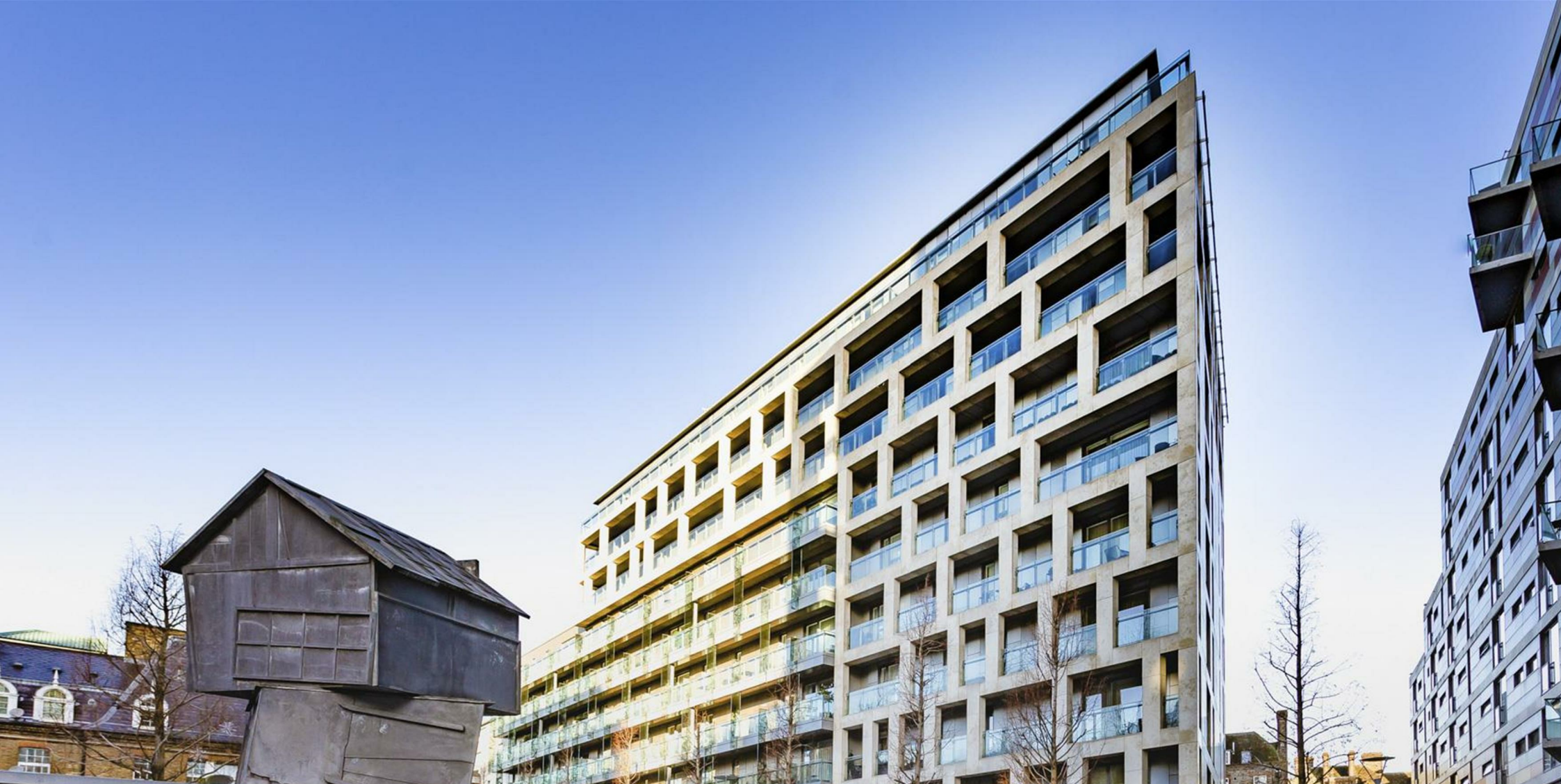
Moore House, 2 Gatliff Road London SW1W